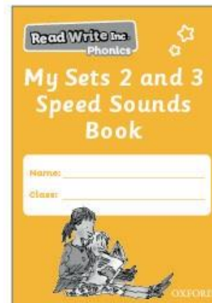
Practise reading and writing sounds in My Sets 2 and 3 Speed Sounds Book .

Ask your child to flick through the book and read the sounds as quickly as he or she can. If your child hesitates reading a sound, the picture is on the back as a reminder. Your child can also practise writing the sound on the same page.